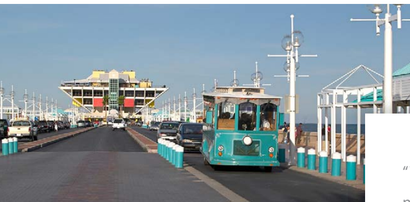
St. Pete Pier in St. Petersburg, Florida - the destination city for the annual Marketing Conference