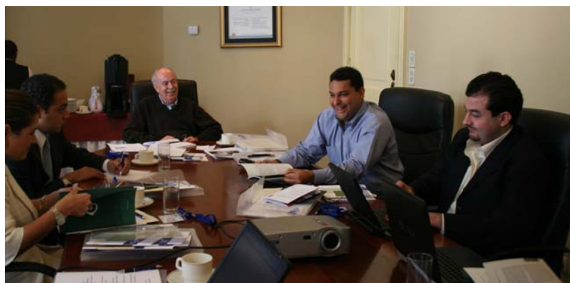
Central American Regional Meeting San Salvador, El Salvador; Offices of Guerrero & Guerrero