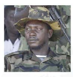
Thomas LUBANGA UPC no. 1