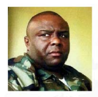
Jean-Pierre BEMBA MLC no. 1