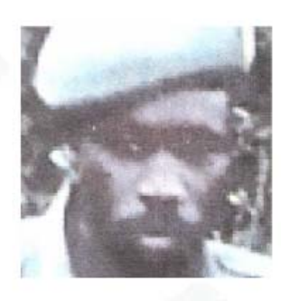
Okot ODHIAMBO LRA no. 3