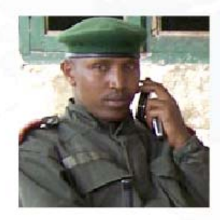
Bosco NTAGANDA UPC no. 3