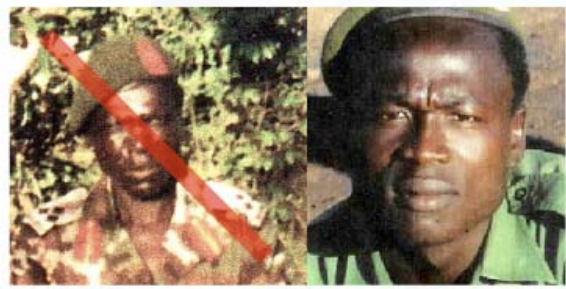
Raska LUKWIYA Killed by Ugandan army in confrontation Dominic ONGWEN