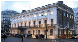
Abercrombie & Fitch

© Boodle Hatfield LLP. All rights reserved.