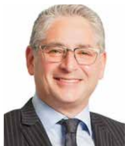
Canada: Ontario Collins Barrow Toronto LLP