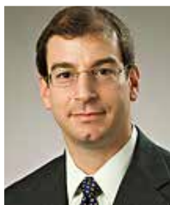
USA: Massachusetts Riemer & Braunstein LLP

Quentin (Quent) Boyken qrboyken@belinmccormick.com