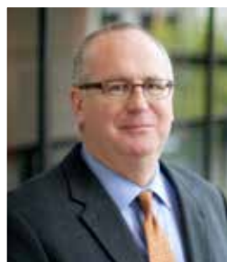
USA: Kansas Martin, Pringle, Oliver, Wallace & Bauer, LLP