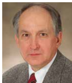
USA: Louisiana Milling Benson Woodward, LLP