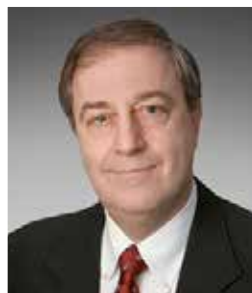
USA: Illinois Barack Ferrazzano Kirschbaum & Nagelberg LLP