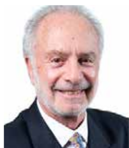
Canada: Ontario Collins Barrow Toronto LLP