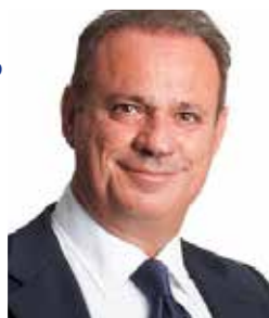
Canada: Ontario Collins Barrow Toronto LLP