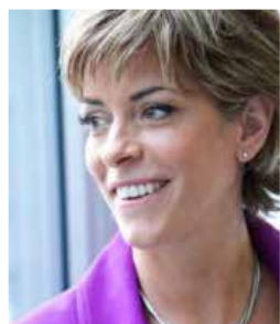
Canada: Ontario Collins Barrow Toronto LLP