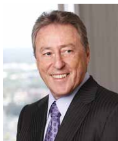
USA: Michigan Jaffe, Raitt, Heuer & Weiss, P.C.