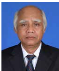
Indonesia KAP. Hertanto, Sidik & Indra