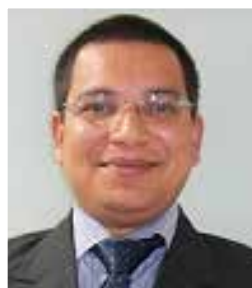
India: Delhi AJSH & Co. Chartered Accountants