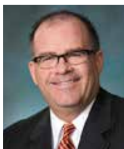
USA: Nevada & New Mexico Lewis Roca Rothgerber LLP