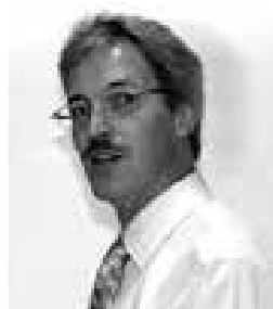
Germany: Pforzheim / Stuttgart Aisenbrey Weinlader & Partner