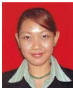
Indonesia KAP. Hertanto, Sidik & Indra