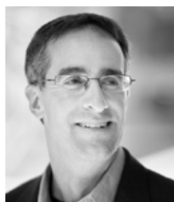
USA: California: San Francisco Coblentz, Patch, Duffy & Bass LLP