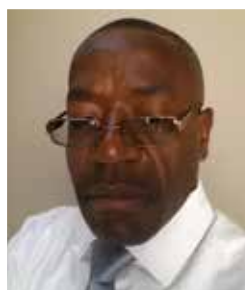
Zambia Simeza, Sangwa & Associates Advocates