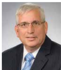
USA: Massachusetts Samet & Co.