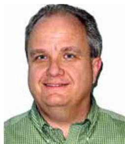
USA: California: Costa Mesa KMJ | Corbin & Company