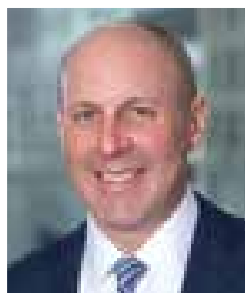
USA: New York: New York Berdon LLP