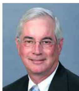
USA: South Carolina Smith Moore Leatherwood LLP