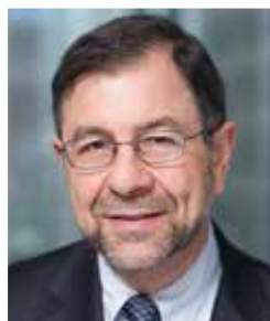
USA: New York: New York Berdon LLP