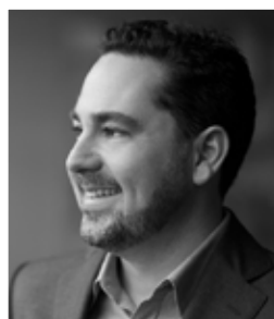
USA: California: San Francisco Coblentz, Patch, Duffy & Bass LLP