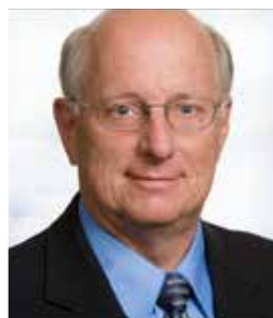
USA: North Carolina & Virginia Williams Mullen