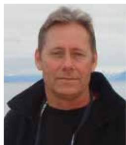
USA: California: San Francisco Hemming Morse, LLP