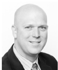
USA: California: San Francisco Hemming Morse, LLP