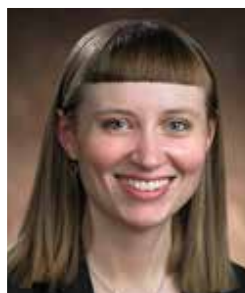
USA: Colorado, Minnesota & South Dakota Lindquist & Vennum