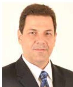
Venezuela Travieso Evans Arria Rengel & Paz