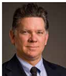
USA: Oklahoma Conner & Winters, LLP