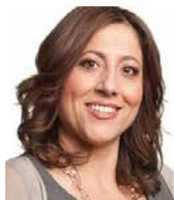
Canada: Ontario Collins Barrow