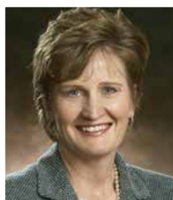
USA: Colorado, Minnesota & South Dakota Lindquist & Vennum