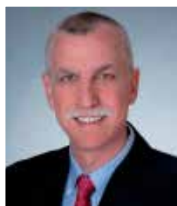
USA: California: Los Angeles Mitchell Silberberg & Knupp LLP