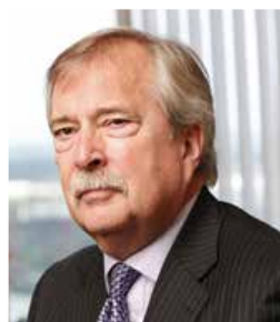
USA: Michigan Jaffe, Raitt, Heuer & Weiss, P.C.