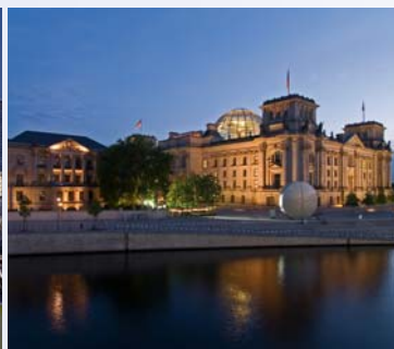
Berlin, Germany May 5-7, 2008