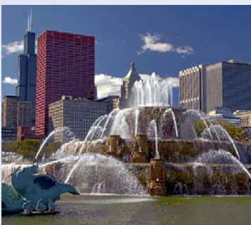
Chicago, Illinois October 18-20, 2007

Preparations for this conference are already in full force and it is expected to be another highly successful networking event. Mark your calendar and plan to join your fellow TAGLaw members in Illinois's Windy City.