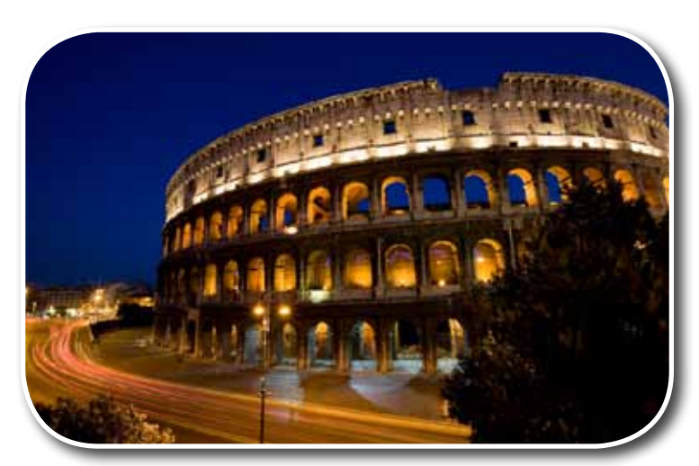
Italy October 2012