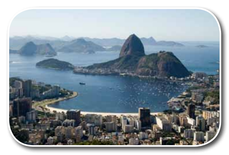
Rio de Janeiro, Brazil October 2011