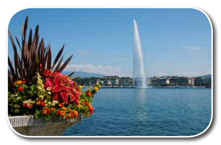
Geneva, Switzerland May 2011