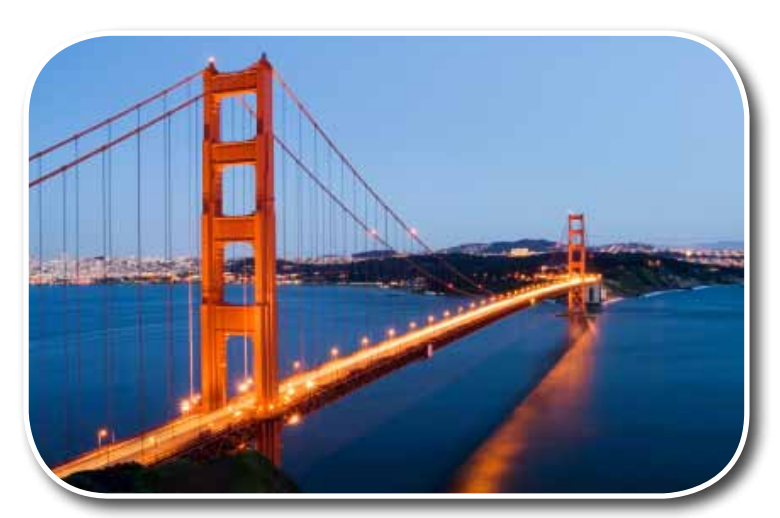
San Francisco, CA, USA May 2012